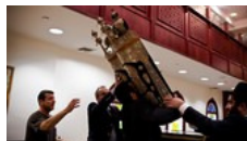
Torah Lifters Pray for Successful Hoist