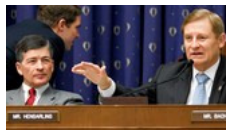
Money Funds' Battle Royal