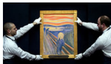
Selling 'The Scream'